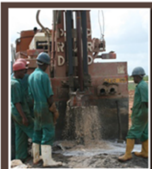
The Segga School has water!

We started drilling for water a few weeks ago and are happy to report that we have potable water at 87 meters! Thanks to all who donated towards this effort! 🌍